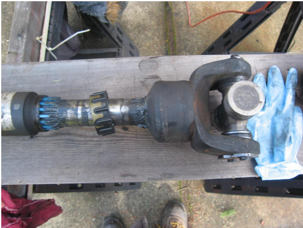
Fwd section DS rotated 90 deg away (note absence match mark out of view toward top)