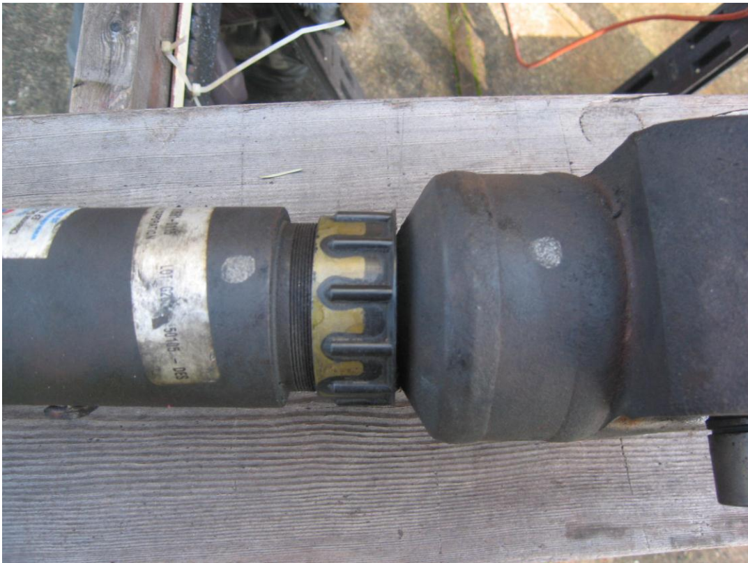
Close up of alignment marks with shudder