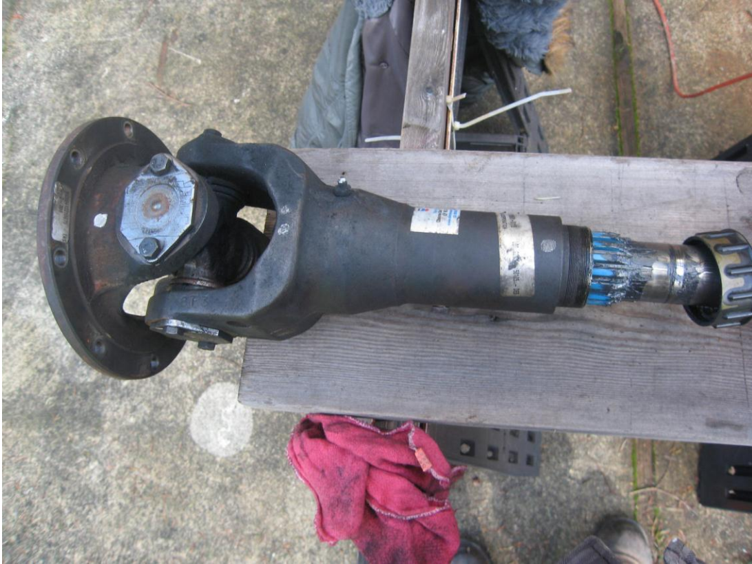
Slip joint seal pulled back from spline joint