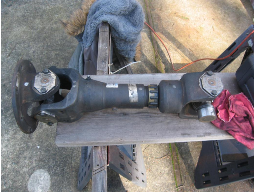
Drive shaft as removed with low spd shudder