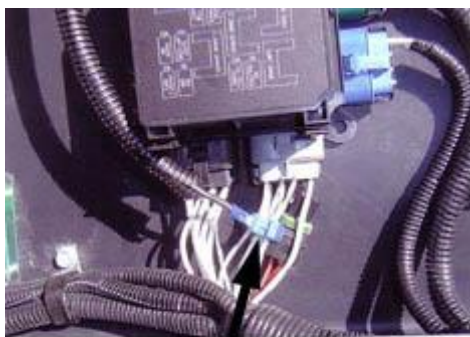
Attach wire to #102