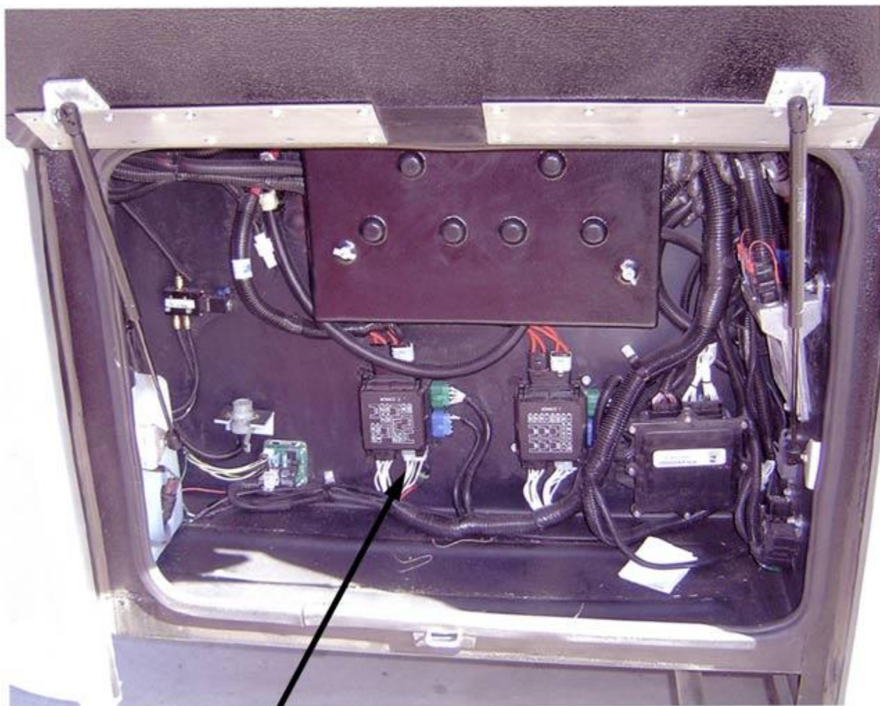
Monaco Box #2 Wire #102 is in bottom right harness