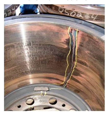
Cracked brake drum