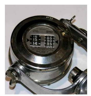
Typical mechanical tester