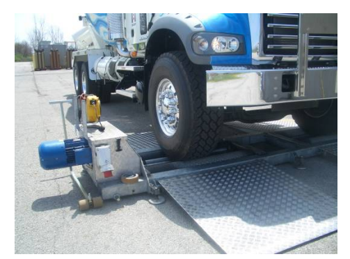
Performance-based brake tester