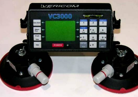
Typical electronic tester