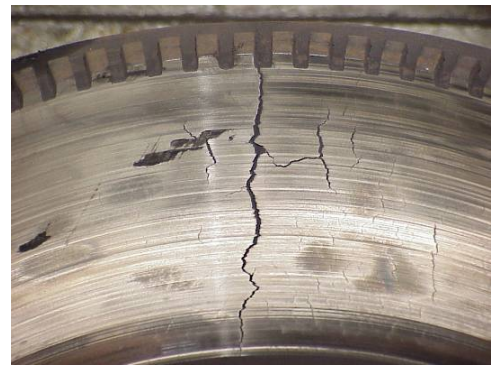
Excessive drum crack