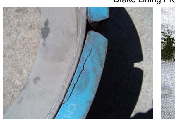
FIGURE 1 Brake Lining Problems