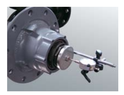
Fig. 3 – A typical endplay gauge.

According to the National Transportation Safety Board, the incidence of wheel separations is about 750 to 1,050 per year. The Safety Board identified improper truck wheel maintenance as a potential cause. Most often cited were inadequate in-service inspection guidelines and failure to adhere to recommended maintenance practices. For your safety and the safety of everyone on the road, always follow recommended wheel-end inspection and maintenance guidelines.