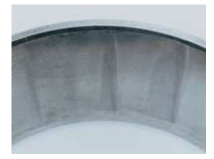
Fig. 1 - Outer race (cup) scalloping; uneven localized wear resulting from excessive endplay.

If there is a questionable increase in mounted endplay (internal axial clearance) in the wheelend, a thorough investigation of the entire system should be carried out and documented.